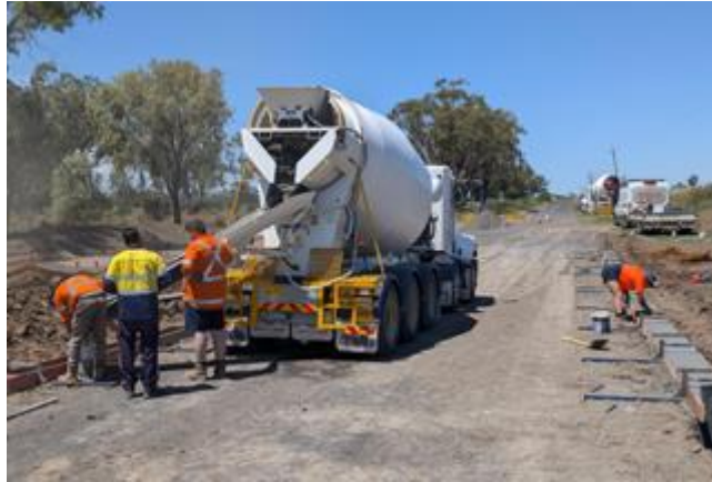
Croppa Creek Road, Floodway 5 cut off walls