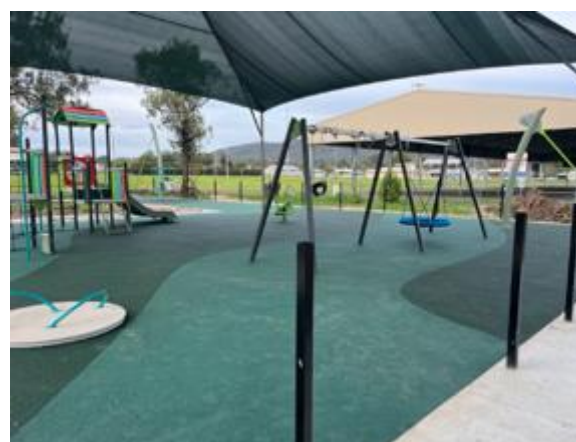
Sofffall being laid in CWA Bingara