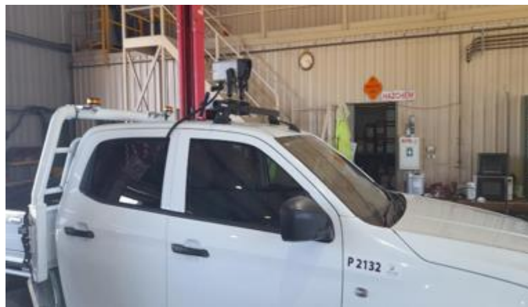
P2132 – Isuzu Dual Cab Utility for Road construction

This vehicle has had the RACAS camera installed and will be used for road inspections on a weekly basis.