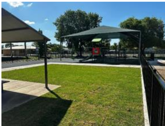
CWA Park upgrade