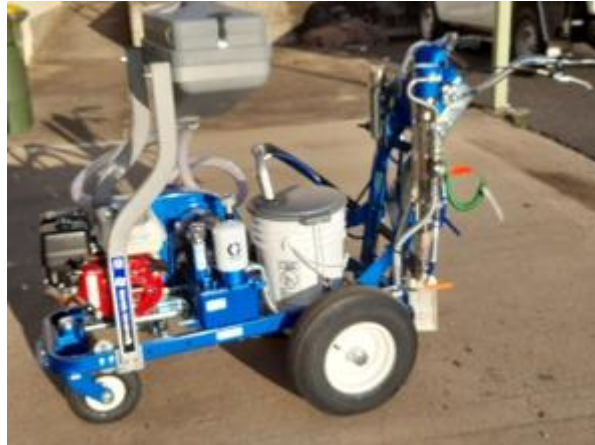
New line marker