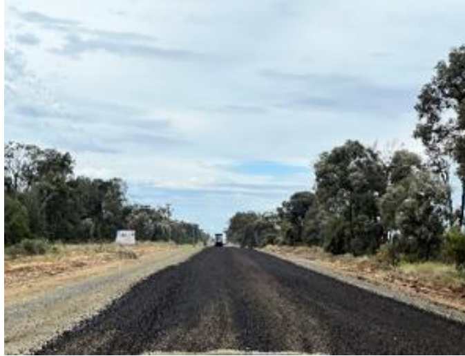
IB Bore Road

The IB Bore Project is complete, with the entire length in Gwydir Shire now bitumen sealed, line marked and signposted. This project was delivered within 0.5% of the $11.54million, with the total cost to Council approximately $60,000.