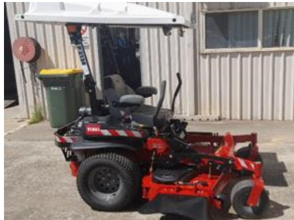
Toro 60" Zereturn mower for North Star