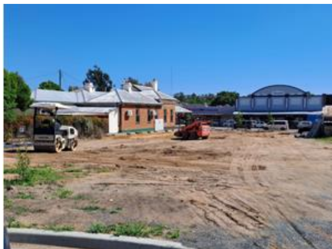
Warialda CBD Park

Negotiations are underway with Telstra and the Department of Communities and Justice for the acquisition of land for the footpath to join the CBD park with Stephen Street.