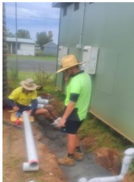
Upper Horton Amenities Plumbing