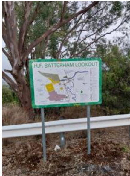
Batterham lookout Information signage