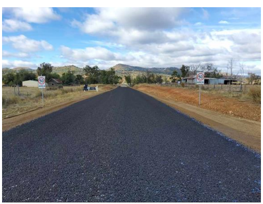
SR11 Horton Road