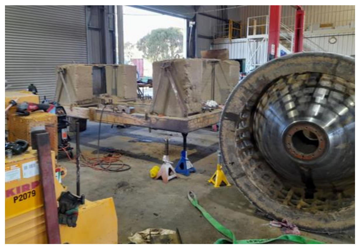
P1134 Grid roller from Bingara had bearings and seals replaced Warialda workshop