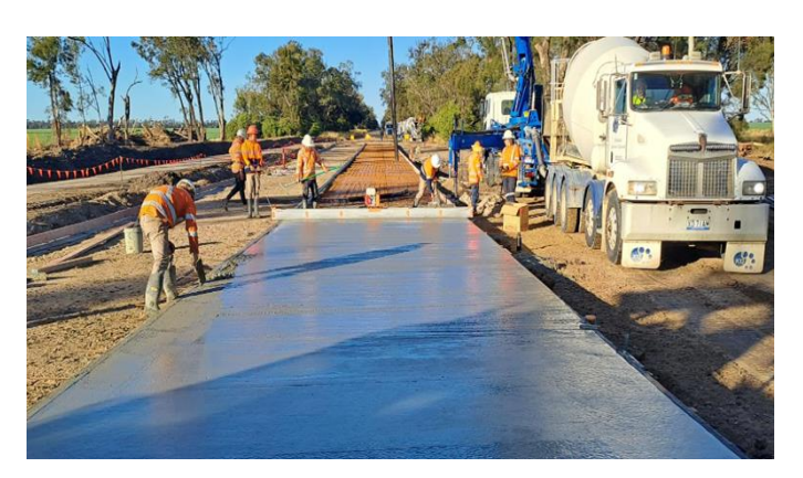
SR41 County Boundary Road, Floodway 6

Contractors have made good progress with all major concrete work on the 6 causeway structures now complete. Concreting works are expected to be completed on budget and well ahead of schedule in August 2023.