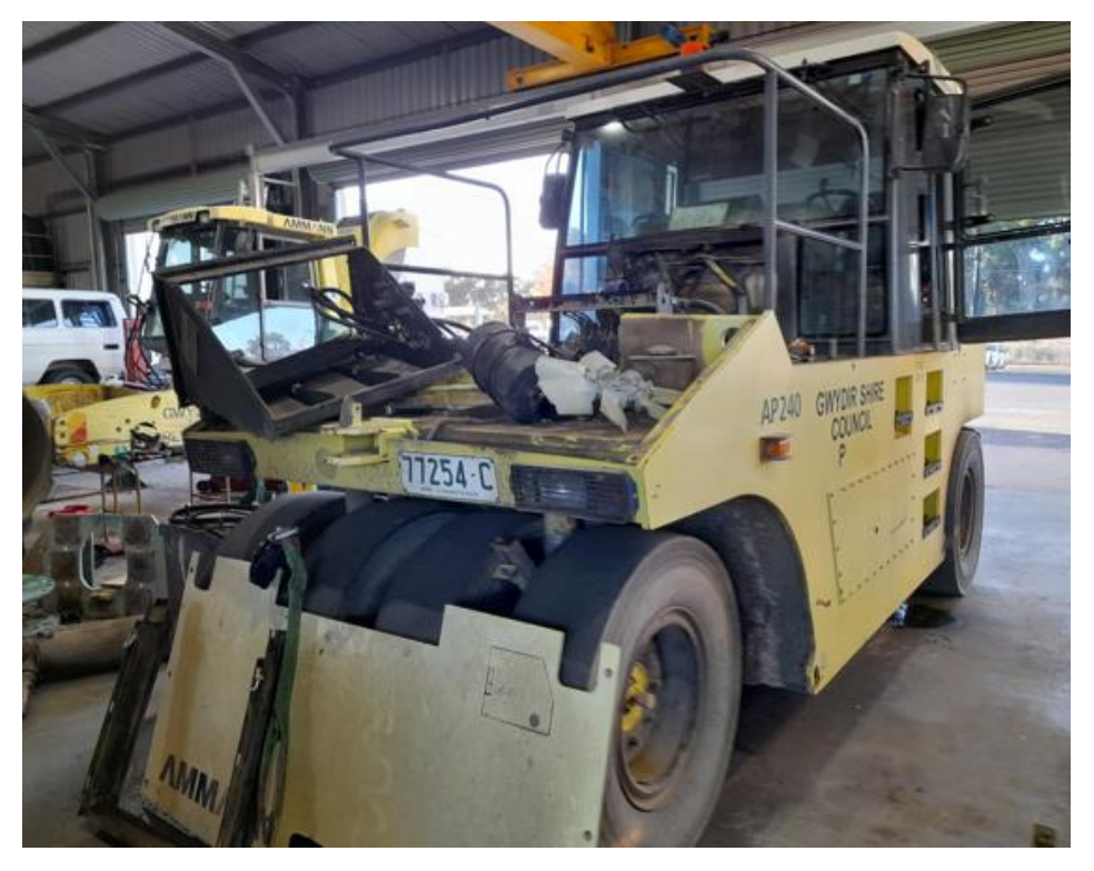
P1475 rubber tired roller – in for new engine mounts and radiator repairs