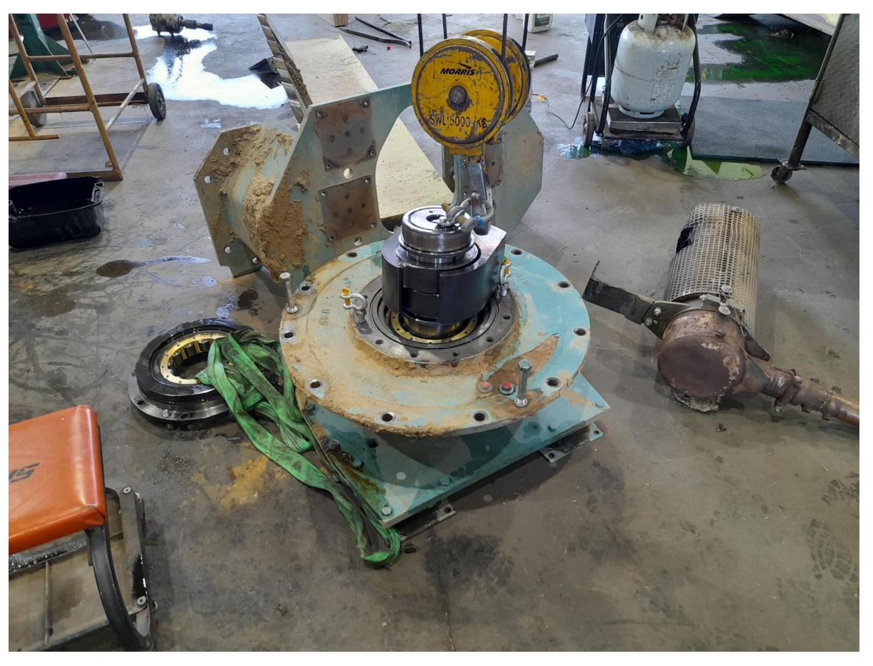
Drum vibration control for the pad foot roller P1474 – required bearing replacement