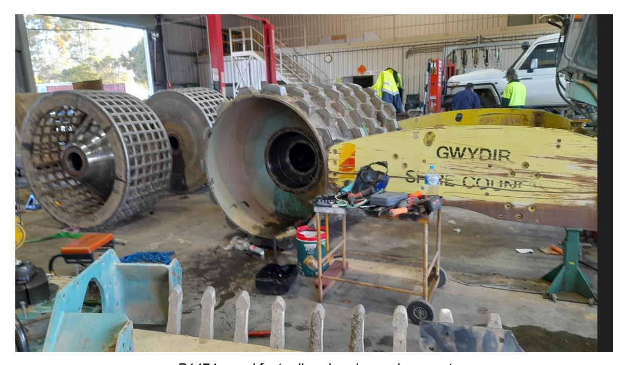
P1474 – pad foot roller - bearing replacement

P1134 – grid roller – new bearings and seals