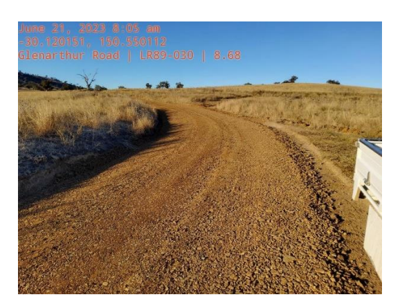
SR89 Glenarthur Road

Council contractors, Rollers Australia have completed formation grading on a 10km section on SR89 Glenarthur Road and currently repairing 3.5km of damages to the road.