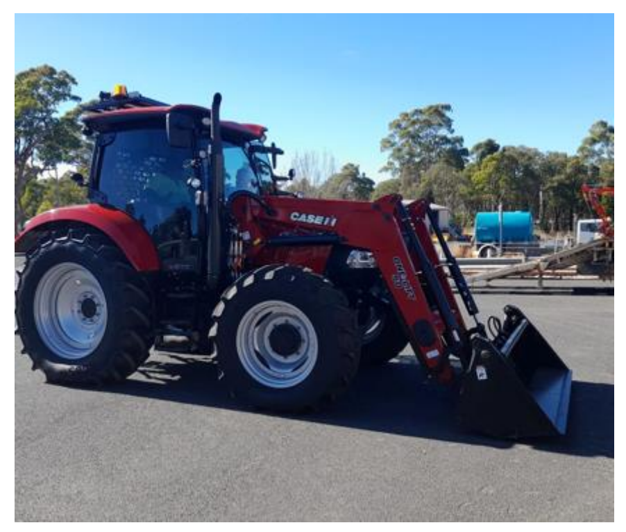
P2076 - Case Maxum 110

Council purchased a new tractor from Kenway and Clarke in Inverell during June.