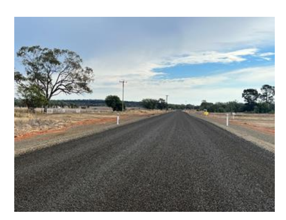
RR7705 North Star Road

The North Star Road Rehabilitation project which involves rehabilitation of 1.2km of existing road and is funded via Transport for NSW's Regional Road Repair Program, this project was completed 28th June 2023.