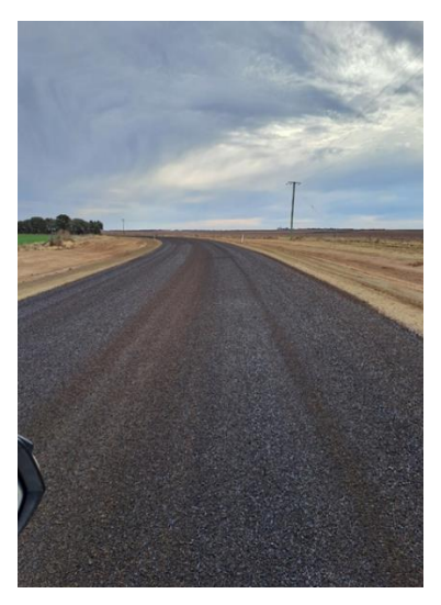
SR9 IB Bore Road

Works continue on the SR9 IB Bore Road upgrade near North Star this month. This project is jointly funded by the Fixing Country Roads Program ($9.54m), and the Federal Government's Heavy Vehicle Safety and Productivity Program ($2m). Work has recommenced this month with 6km of the 20km project bitumen sealed. Simultaneously, stabilisation of the next 2km section is currently underway