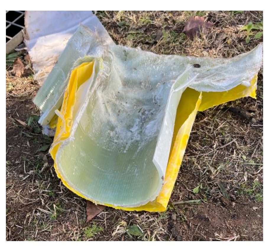
Sample of pipe relining

During June 880m of sewer main was relined in Warialda, the process involved cleaning the sewer mains, installation of soft pvc liner between manholes, inflation of the liner than curing with UV light, effectively forming a pipe within a pipe.