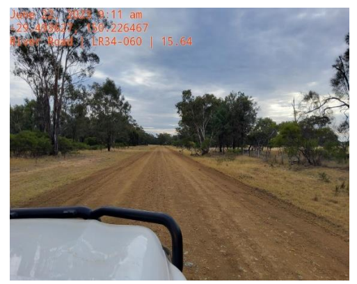
SR41 County Boundary Road SR34 River Road

Council contractors, Rollers Australia have completed formation grading on a 10km section on SR89 Glenarthur Road and currently repairing 3.5km of damages to the road.