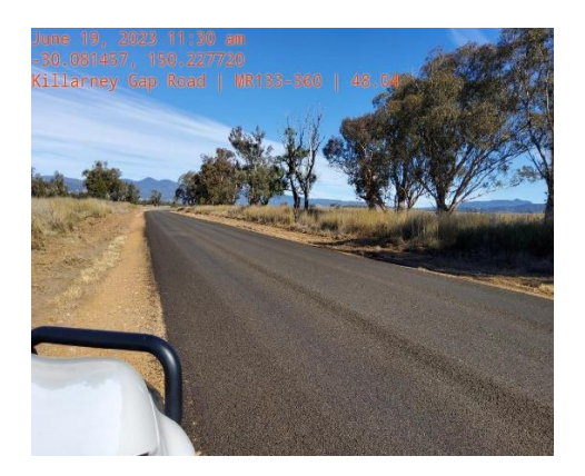
MR133 Killarney Gap Road

Contractors New Pave have been engaged to undertake heavy patching on Council's sealed roads. They have completed work on SR1 Copeton Dam Road, SR2 Bingara Road and MR133 Killarney Gap Road and are currently working on RR7705 North Star Road.