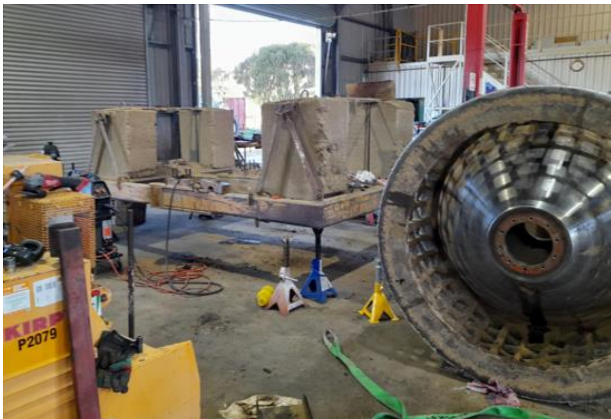
P1134 Grid roller from Bingara had bearings and seals replaced Warialda workshop