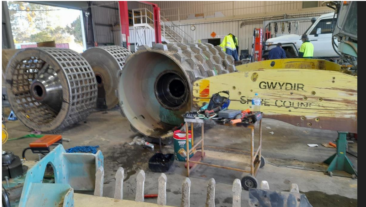
P1474 – pad foot roller - bearing replacement

P1134 – grid roller – new bearings and seals