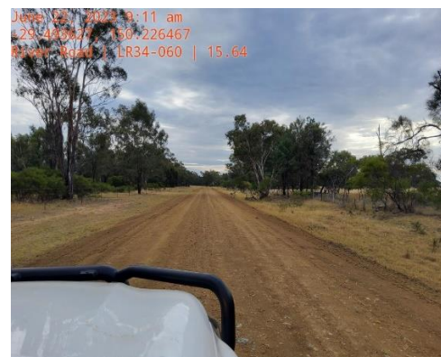
SR41 County Boundary Road SR34 River Road

Council contractors, Rollers Australia have completed formation grading on a 10km section on SR89 Glenarthur Road and currently repairing 3.5km of damages to the road.