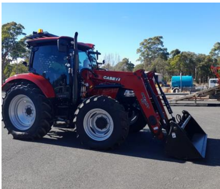
P2076 – Case Maxum 110

Council purchased a new tractor from Kenway and Clarke in Inverell during June.