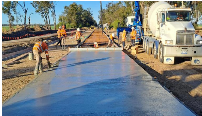
SR41 County Boundary Road, Floodway 6