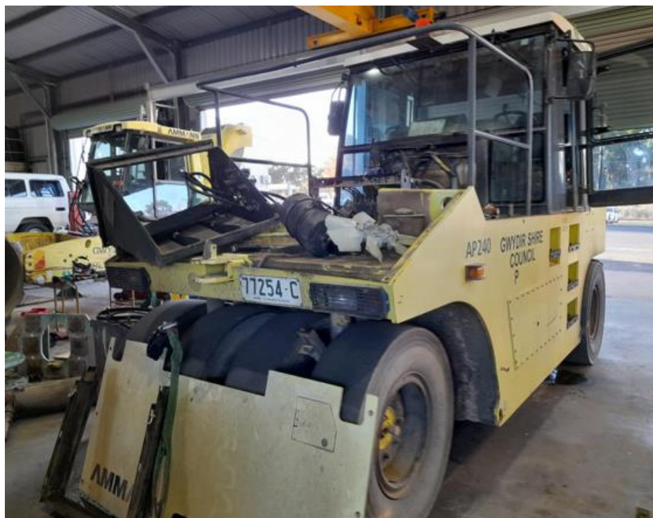
P1475 rubber tired roller – in for new engine mounts and radiator repairs