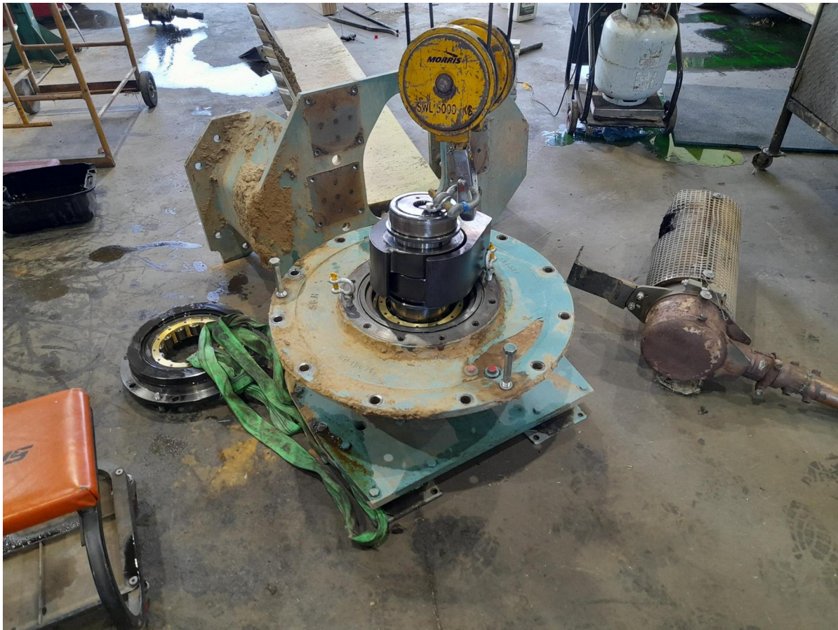
Drum vibration control for the pad foot roller P1474 – required bearing replacement