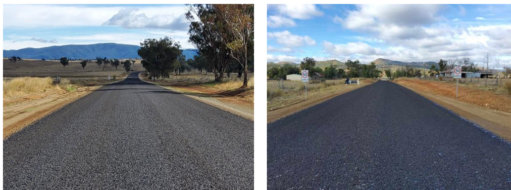
SR11 Horton Road

Construction is complete on the SR11 Horton Road upgrade. This project was funded by the Fixing Local Roads Program ($5m), with Council co-contributing $800,000. The project came within $215 (0.0037%) of its $5,800,000 budget.