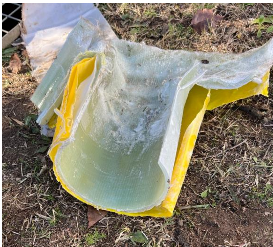
Sample of pipe relining

During June 880m of sewer main was relined in Warialda, the process involved cleaning the sewer mains, installation of soft pvc liner between manholes, inflation of the liner than curing with UV light, effectively forming a pipe within a pipe.