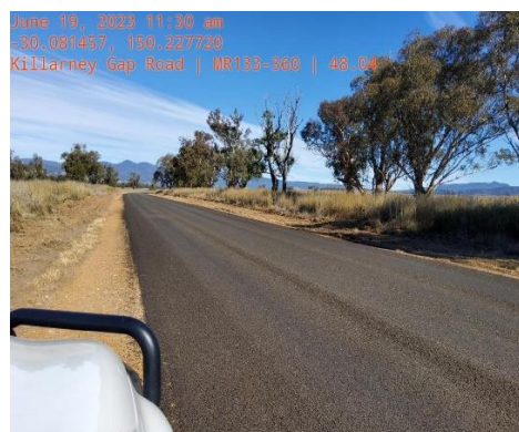
MR133 Killarney Gap Road

Contractors New Pave have been engaged to undertake heavy patching on Council's sealed roads. They have completed work on SR1 Copeton Dam Road, SR2 Bingara Road and MR133 Killarney Gap Road and are currently working on RR7705 North Star Road.