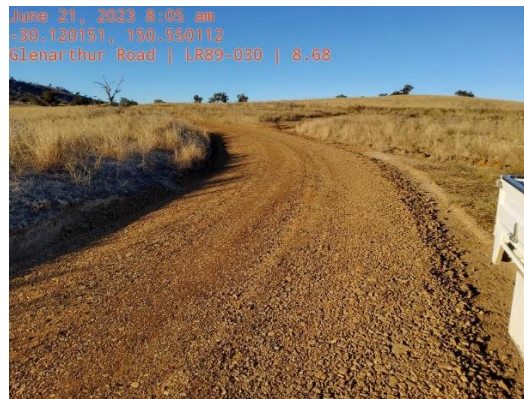
SR89 Glenarthur Road

Contractors New Pave have been engaged to undertake heavy patching on Council's sealed roads. They have completed work on SR1 Copeton Dam Road, SR2 Bingara Road and MR133 Killarney Gap Road and are currently working on RR7705 North Star Road.