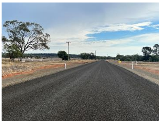
RR7705 North Star Road